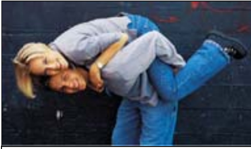
“Piggybacking” or “Coat-tailing” is a method of quickly improving one’s credit score.

Since credit scores are derived from computer programs that analyze long-term payment histories, undoing a poor score can take quite awhile; a number of good years may be required to negate one stretch of trouble.